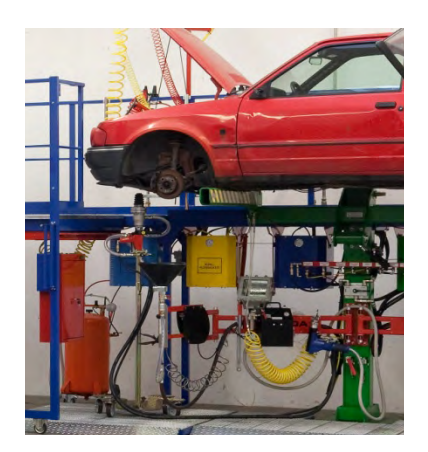
High Quality Product