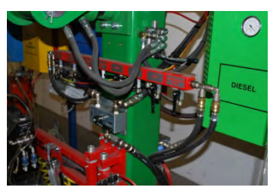
Easy control panel

The SEDA SingleStation is an All-In-One top class solution for scrap car drainage. For all who need something bigger we advise the SEDA DoubleStation, which allows you to work on two cars at the same time with just one station.