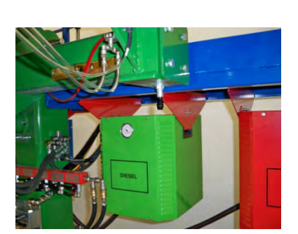
Strong, persistant pumps

Contact us for more information about the SEDA SingleStation or other SEDA products!