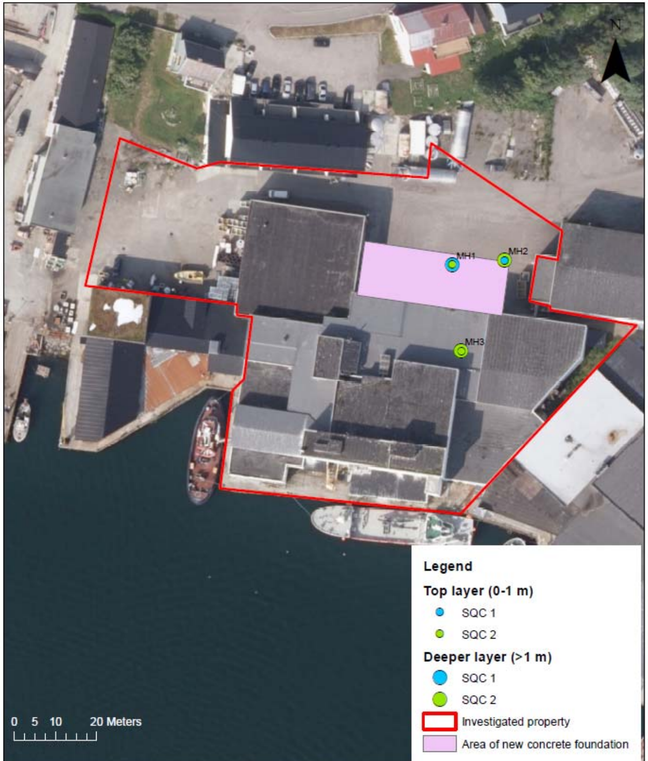
Figure 4-1: Sample locations showing maximum SQC in top soil (0-1 m) and deeper layer (>1 m).

Figure 4-1 presents the sample locations with the maximum contamination levels (SQL) for each test pit, MH1-MH3.