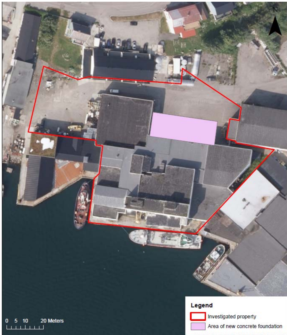
Figure 2-2: Havnegata 1, Myre harbour. The investigated site, 65/72, marked with a red line. The buildings shown are removed, and only the concrete foundation remains. Area of new concrete foundation is marked in pink.

The investigated site is a former fishery, see Figure 2-2. All of the buildings at the site are removed, only the concrete foundation remains. The new fishing station will be established on the existing foundation, and partly on new concrete foundation which will be constructed at the northeastern corner.