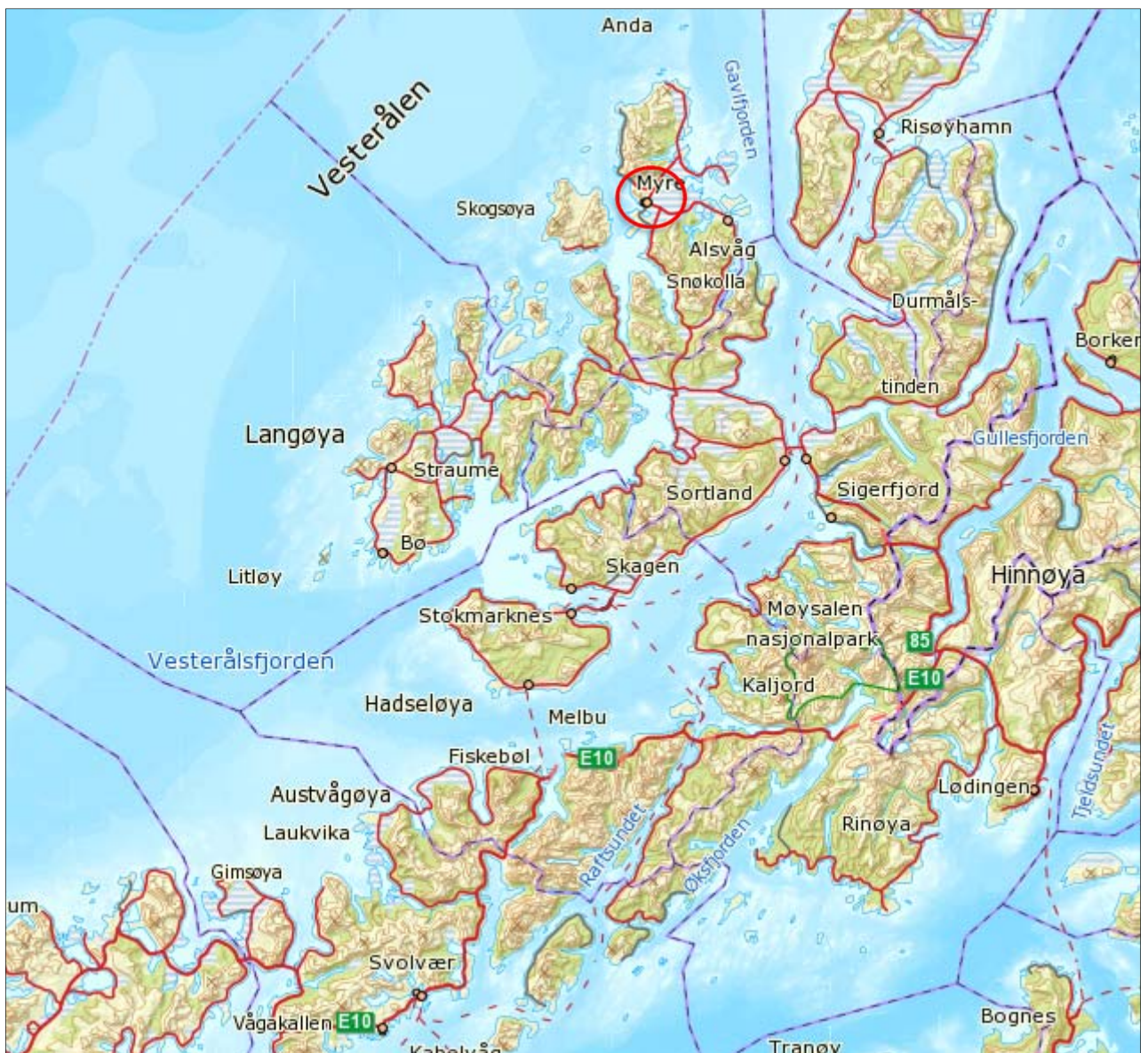
Figure 2-1: Myre harbour, in the municipality of Øksnes, in Vesterålen. The investigated area is marked with a red circle.

Havnegata 1 is located in an industrial area at the harbour of Myre in Vesterålen. An overview map of Myre and the investigated area is shown in Figure 2-1.